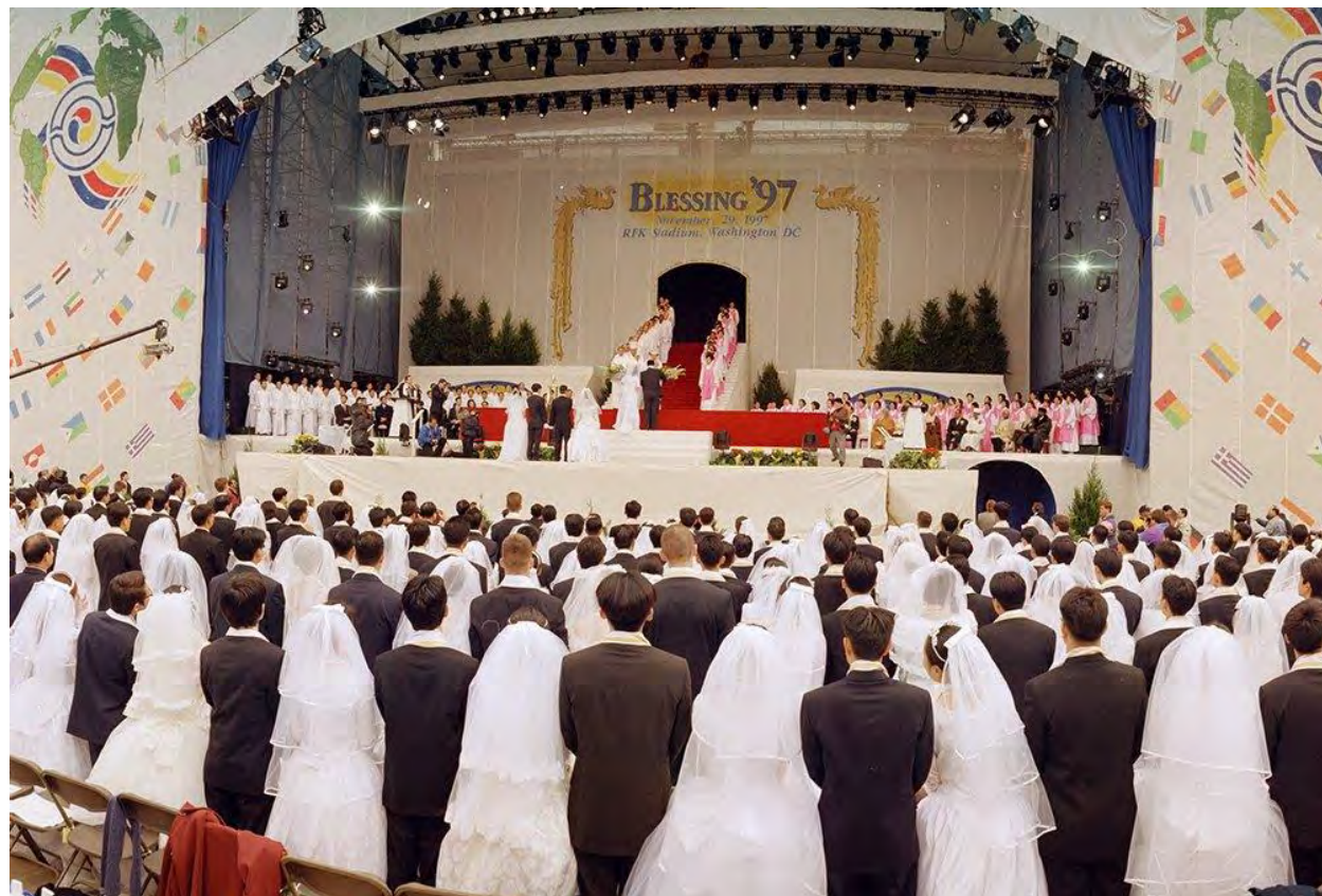
40 Million Couple Marriage Blessing Ceremony on November 29, 1997

"The time for marriage on a global scale has come," wrote True Father in his book, Cheon Seong Gyeong (CSG). "The 3.6 million couples will establish the liberated realm of the Blessing that is open to anyone."